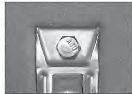
NEW X-SEAL™ TAPE "PRESSURE SEALS" BETWEEN ANCHOR & SHEATHING FOR ADDED PROTECTION

The X-SEAL™ Anchor meets or exceeds requirements of the Commonwealth of Massachusetts State Building Code for air leakage and water penetration. Contact H&B's technical department for test results.